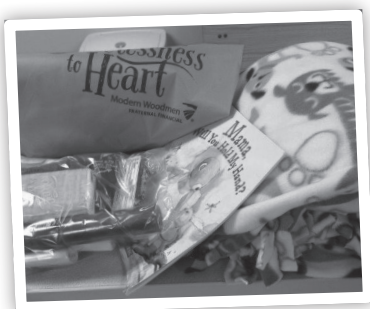
Modern Woodmen donated overnight bags for the kids at the Women & Children's Home. These contained a blanket, a book, and hygiene items. How fun!