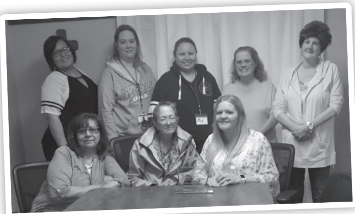
The hard working and caring staff of the Women & Children's Home