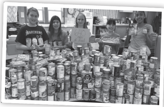
Canyon Lake Elementary held a food drive for Cornerstone. Look at all that food!