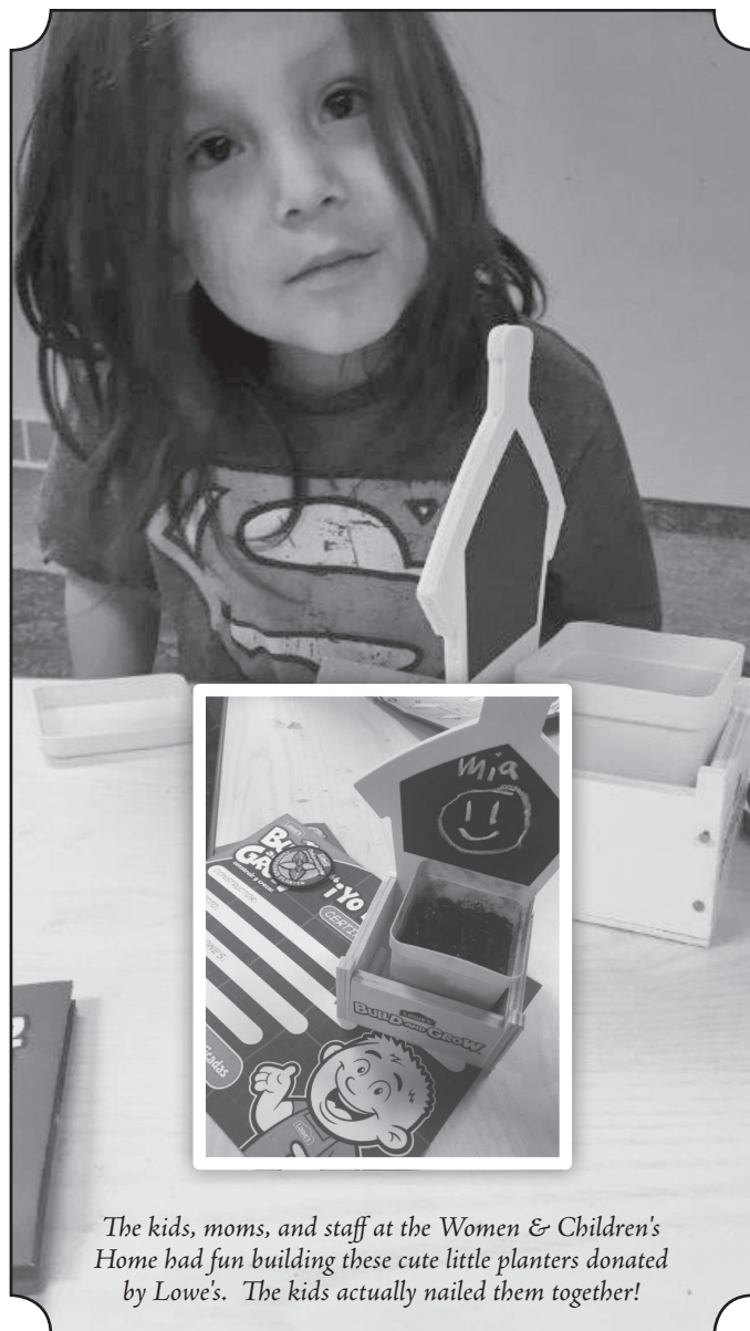
The kids, moms, and staff at the Women & Children's Home had fun building these cute little planters donated by Lowe's. The kids actually nailed them together!